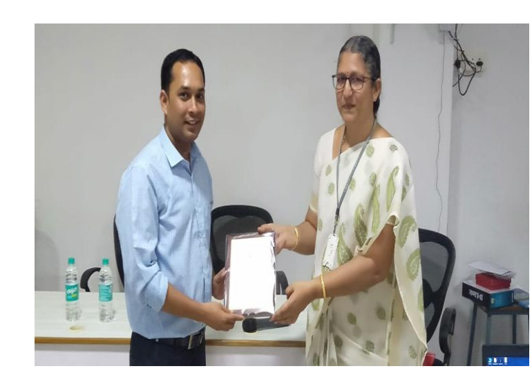
Convenor, HOD of EEE Felicitating Resource person with a Memento.